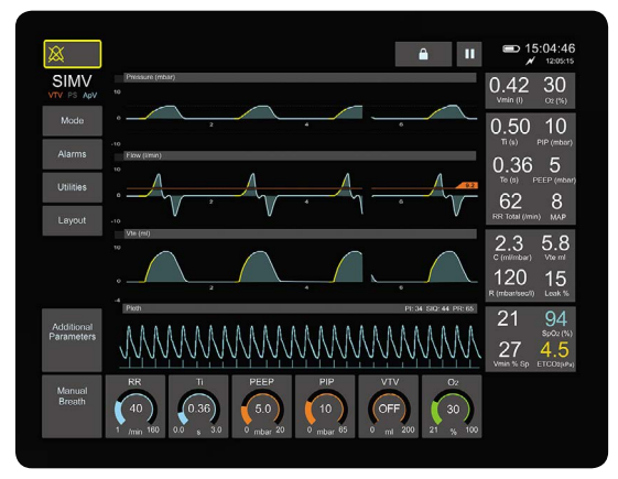
Synchronised Intermittent Mandatory Ventilation, or SIMV , is a patient interactive mode of ventilation. It can be used with PSV and/or VTV.

The SLE6000 sees the introduction of a new Lunar<sup>™</sup> interface, which incorporates a low-glare screen (in keeping with the increased emphasis on developmental care) whilst setting a new benchmark in usability. Recent research in developmental care has shown that excessive light is involved in retinal damage, sleep pattern alterations, disturbance of circadian rhythms and poor growth<sup>[4]</sup>.