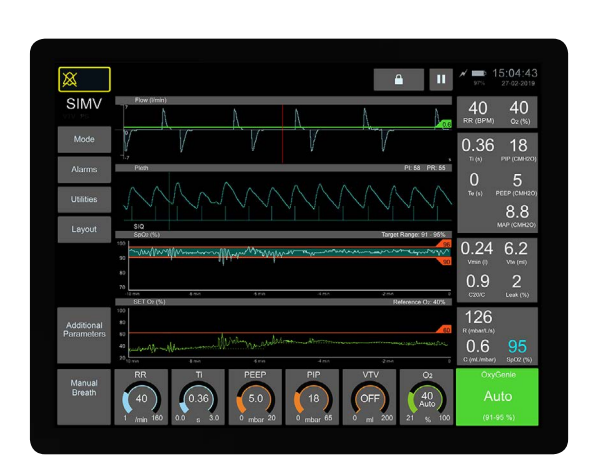
OxyGenie® An automatic O_2 control for the SLE6000 ventilator. The SLE6000 continuously adjusts the FiO<sub>2</sub> to maintain a stable SpO<sub>2</sub><sup>[9]</sup>.