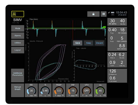
Loops A lung mechanics screen shows additional data - in this case two loops. A secondary column of data can be shown when required.