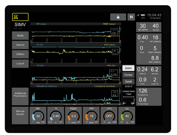
Trends Up to 14 days of trends are stored for all parameters. Zoom and scroll to find any parameter's values at a particular time.